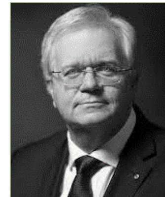
Prof Brian Schmidt AC Vice-Chancellor and President The Australian National University (ANU) 2011 Nobel Laureate in Physics

'The Need for Rationality of the Human Collective'