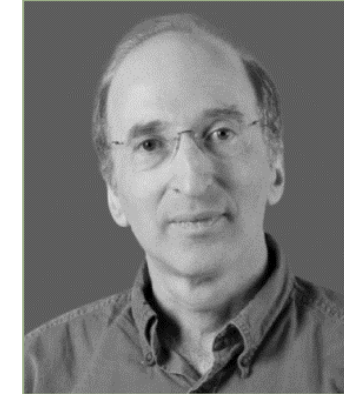
Prof Saul Perlmutter Professor of Physics, University of California, Berkeley Senior Scientist, Lawrence Berkeley National Lab 2011 Nobel Laureate in Physics

'Calming Our Existential Fears by Building a Strong Societal Deliberative Capacity'