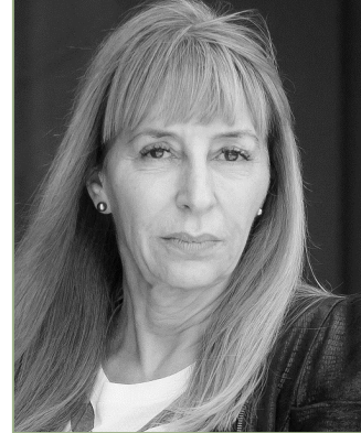
Baroness Susan Greenfield CBE Founder and Chief Executive Officer Neuro-Bio Limited